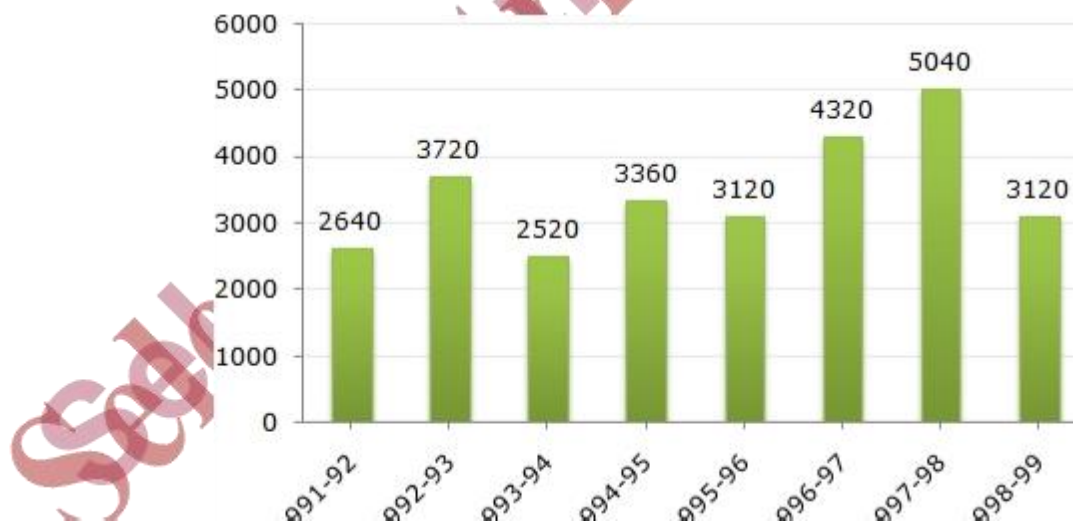
Foreign Exchange Reserves of a Country. (in million US $)

The bar graph below shows a country's foreign exchange reserves (in million US $) from 1991 - 1992 to 1998 - 1999.